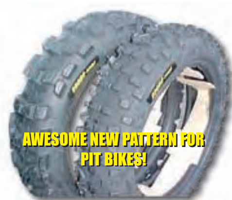
OF215 and OF217 Intermediate terrain